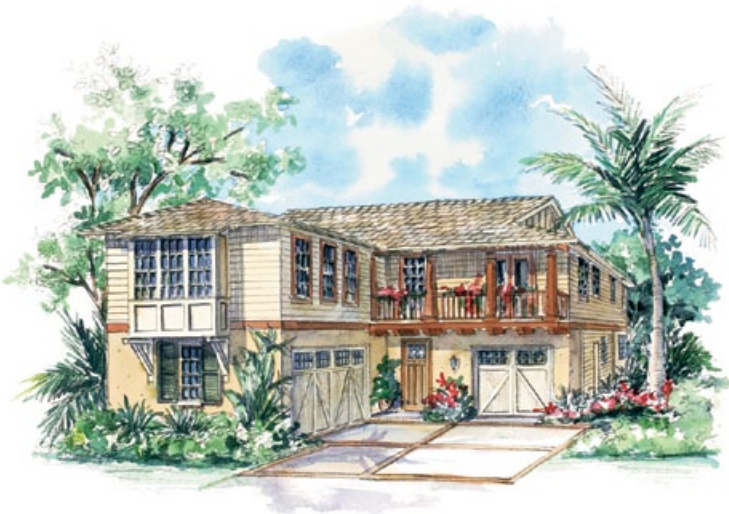
RESIDENCE 60.40 A (R)