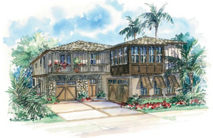
RESIDENCE 60.40 B (MODEL)