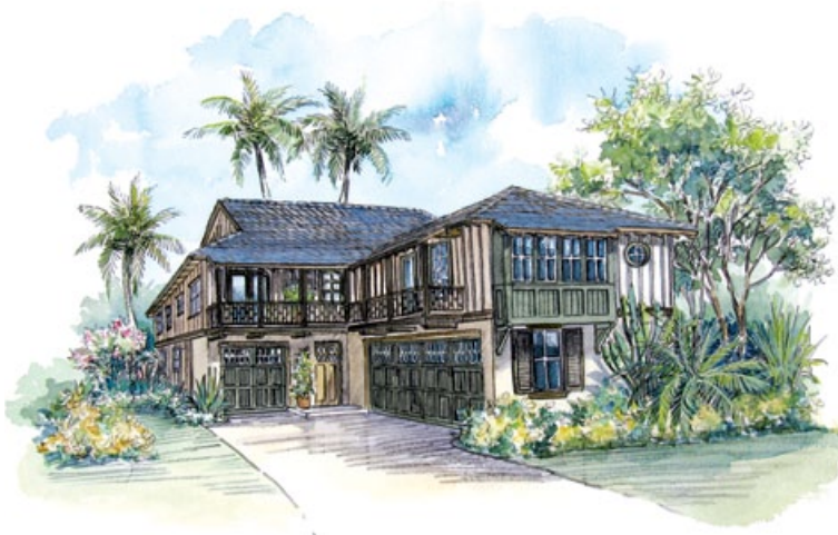
RESIDENCE 60.40 D