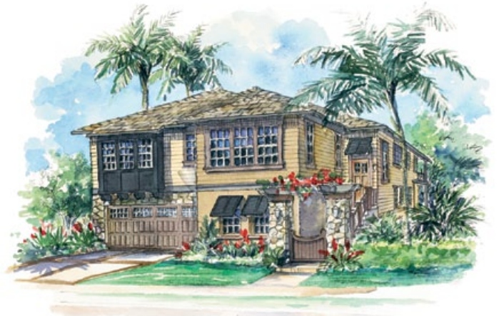
RESIDENCE 60.20 B (MODEL)