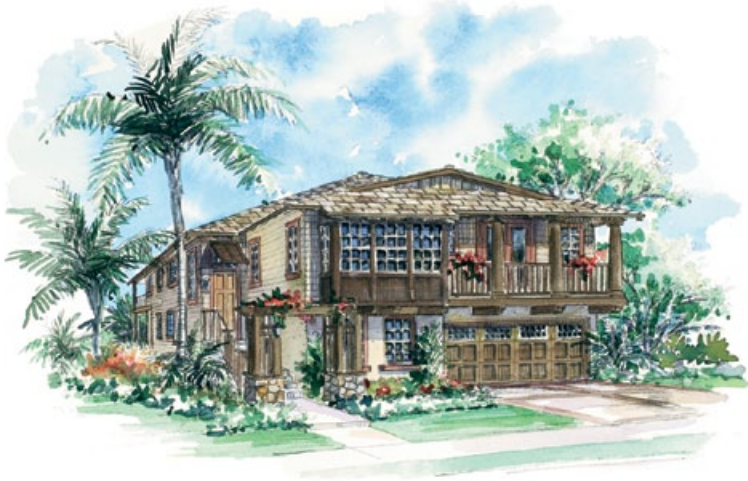
RESIDENCE 60.20 A (R)