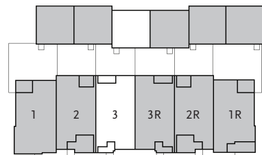
MODEL BUILDING LAYOUT